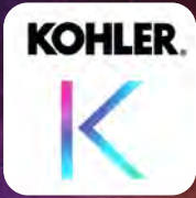
Kohler Konnect ®

Complementing other Kohler Konnect ® products, Numi 2.0 seamlessly blends into the smart home bathroom suite for a fully connected experience.